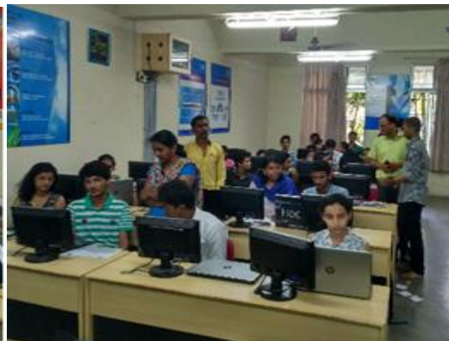
Value Addition Program C++ Course Presentations of Students.